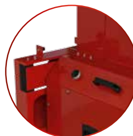
With an adjustable left side