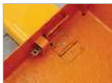
Security to prevent slipping from the straddle stacker